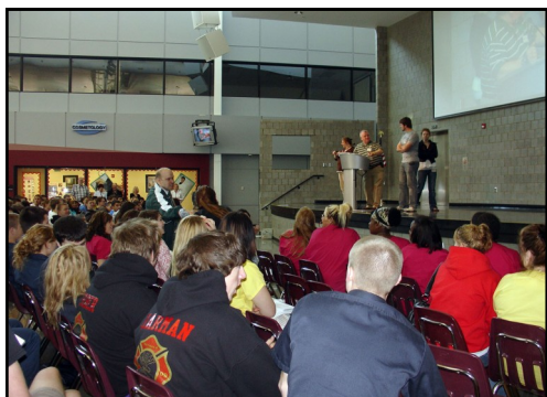
In February and April, senior and junior students respectively attended a presentation of CSU's "College Road Rules." The agenda covered college planning and resources, the value of a college education, financial resources, scholarships and other options. Students who might not have been planning to attend college learned of various ways to achieve a college education. The event was initiated to meet the state challenge to increase college attendance and college graduation rates. The event was the first partnership between high schools and a 4-year college.