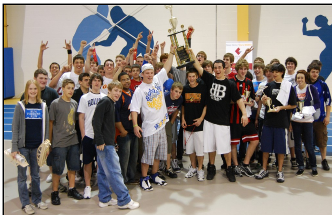
Students from Brecksville-Broadview Hts. celebrate winning the trophy for the second year in a row.

Career Pathways and the industrial technology district teachers held the 8th consecutive Technology Competition at Independence Field House on May 2. Students used their pre-engineering knowledge and skills to design and build structures and vehicles. Airplanes and magnetic levitation cars were timed and the winner was selected based on optimum performance. Towers and bridges were stressed to failure to determine the winning design. Technology Wars pitted four school teams against each other in a problem-solving event.