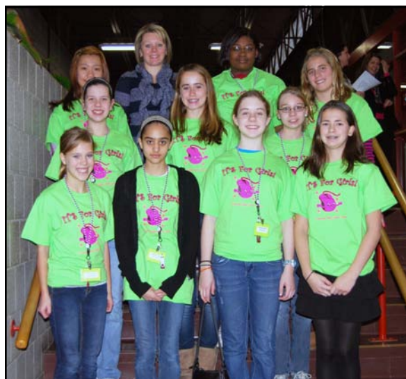
Article on IT's for Girls activities at CVCC continued on Page 6