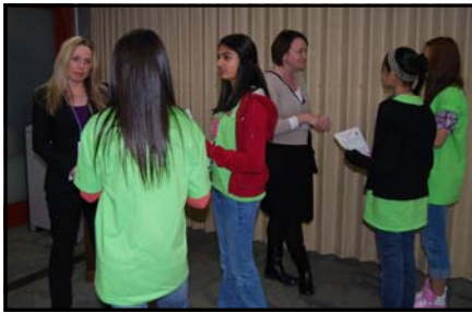
Industry professionals joined the girls for a Bingo game icebreaker that got everyone acquainted and chatting.

The entire program was funded by private organizations and grants. Sponsors that provided funding, materials and instructors for the 2010 event were National Girls Collaborative Project, which is funded by the National Science Foundation; Children's Technology Workshop; NEOSA (Northeast Ohio Software Association); the COSE Technology Network and NEOSIM (Northeast Ohio Society for Information Management).