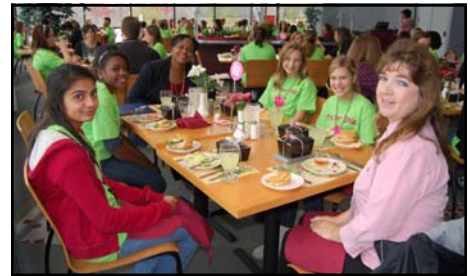
The girls enjoyed sharing lunch, prepared by CVCC Culinary Arts students, with industry professionals to learn about their jobs and career paths.